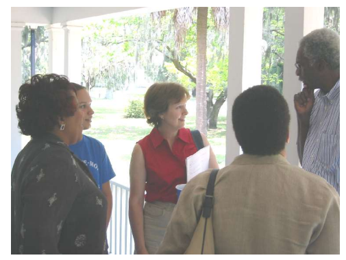
Gullah planning meeting in July

the printing and publication process, and a program to promote the use of the translation. The goal is to turn the manuscript over to the American Bible Society for printing by the end of this year, and to have it in print before the end of 2005.