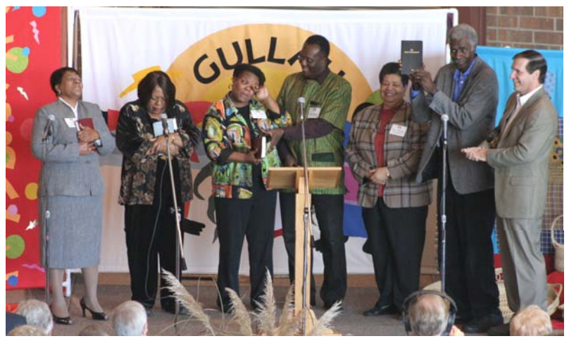
Holding the published Gullah New Testament for the first time, Nov. 5, 2005

The Gullah New Testament has proven to be extremely popular, and only six months since its release, the first printing of 10,000 copies is virtually sold out and another 6000 are being printed by the American Bible Society.